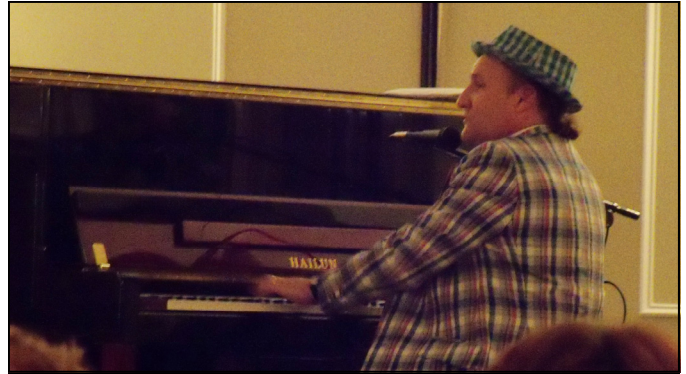
And the captured audience was mesmerized...

The event netted nearly $2,000 for LVSC but, more importantly, brought a whole new audience to learn about the organization.